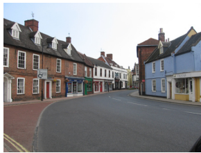
Earsham Street W-E