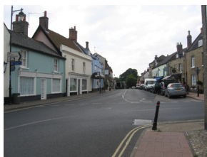
Earsham Street E-W